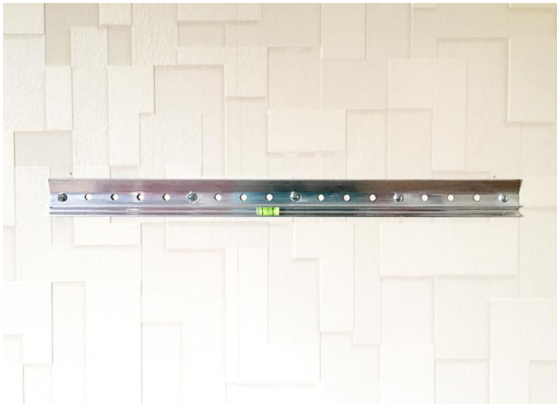
Figure out where you want to attach your headboard to the wall, and mark the center. Keep in mind that the plywood at the bottom should rest behind the mattress. Attach one side of the French cleat to the wall, making sure to hit at least one stud. Attach the other side of the cleat to the back of the headboard, then just hook the two sides of the cleat together to hang on the wall!