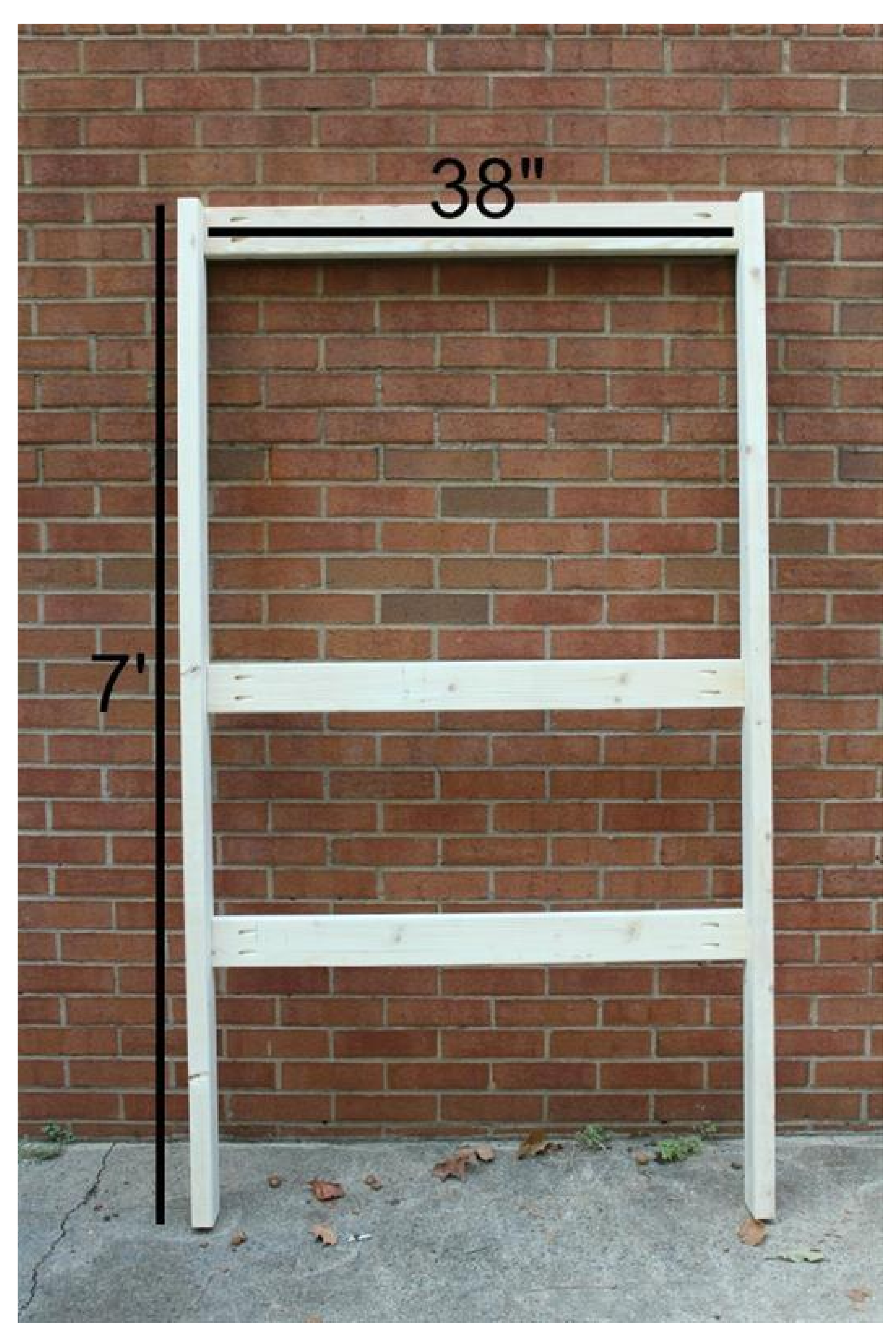
Page 8 of 21