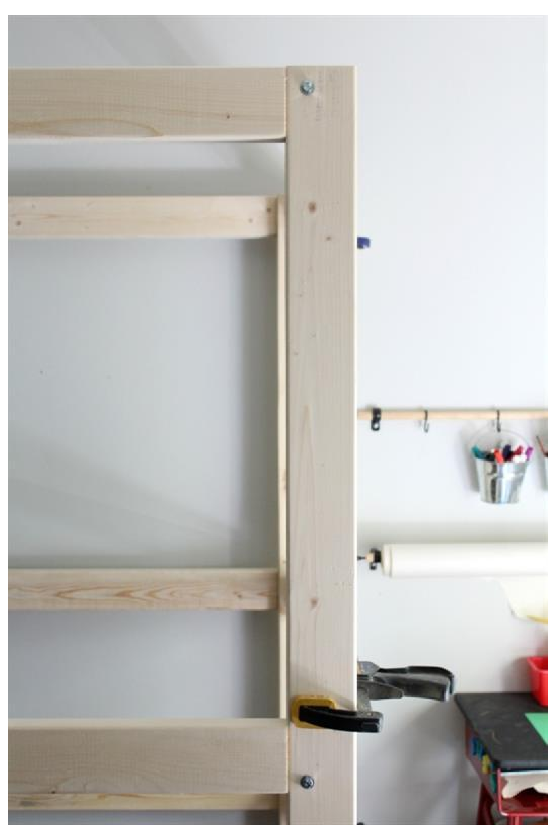
Page 10 of 21