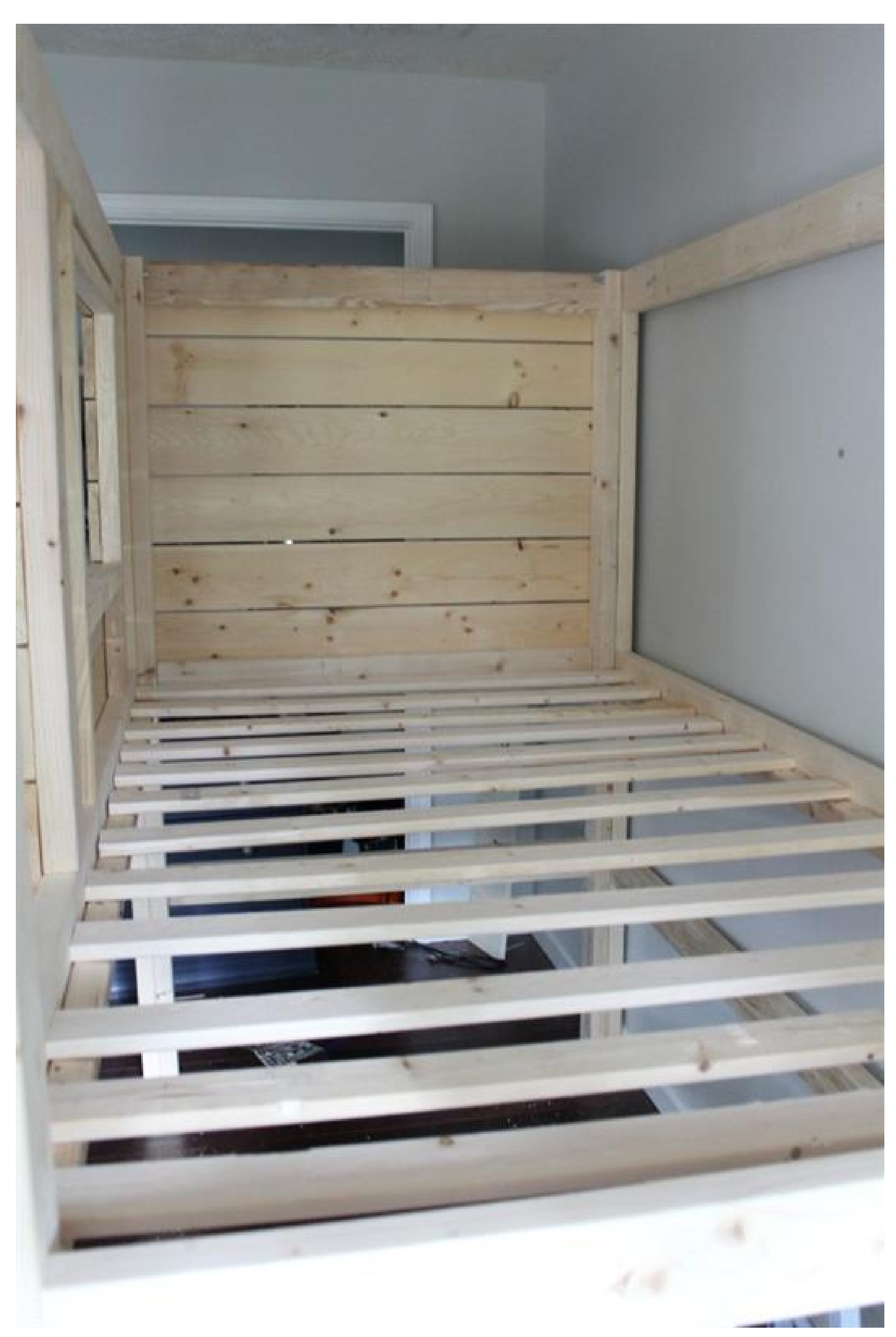
Page 16 of 21