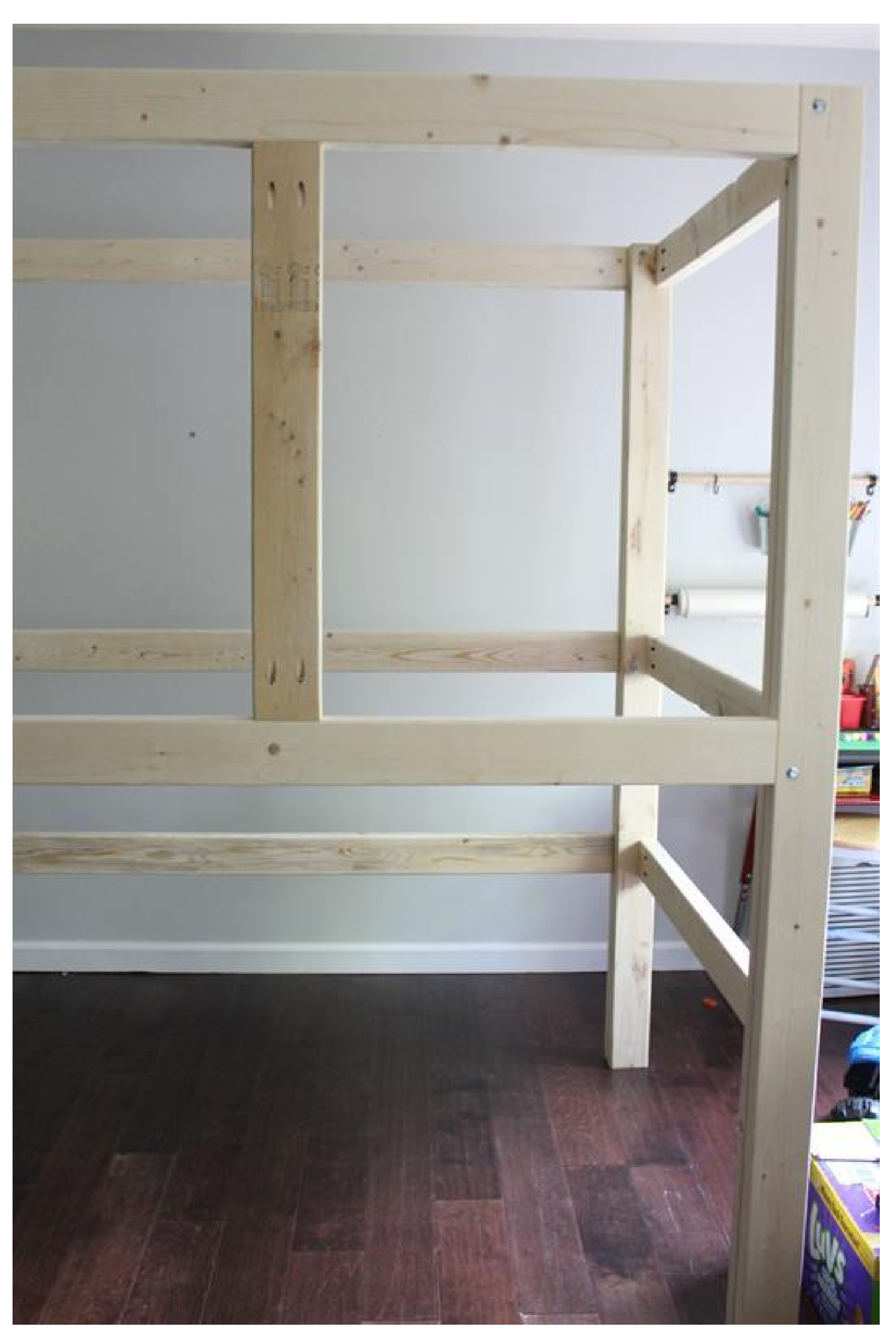
Page 12 of 21